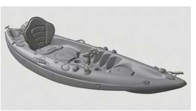
Turbines, ship propellers, small boats