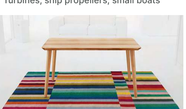
Furniture and room interiors