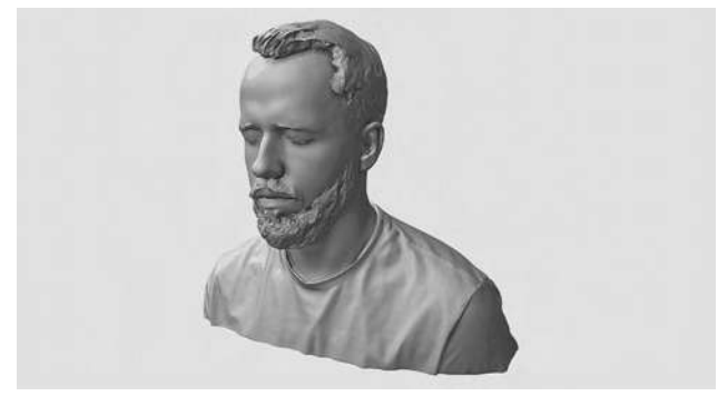
Statues, and the human body